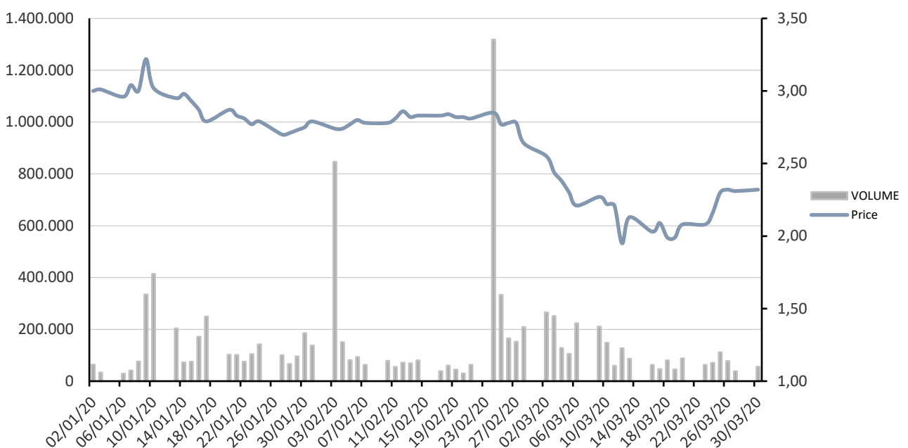
Share volumes and prices from up to 31 March 2020