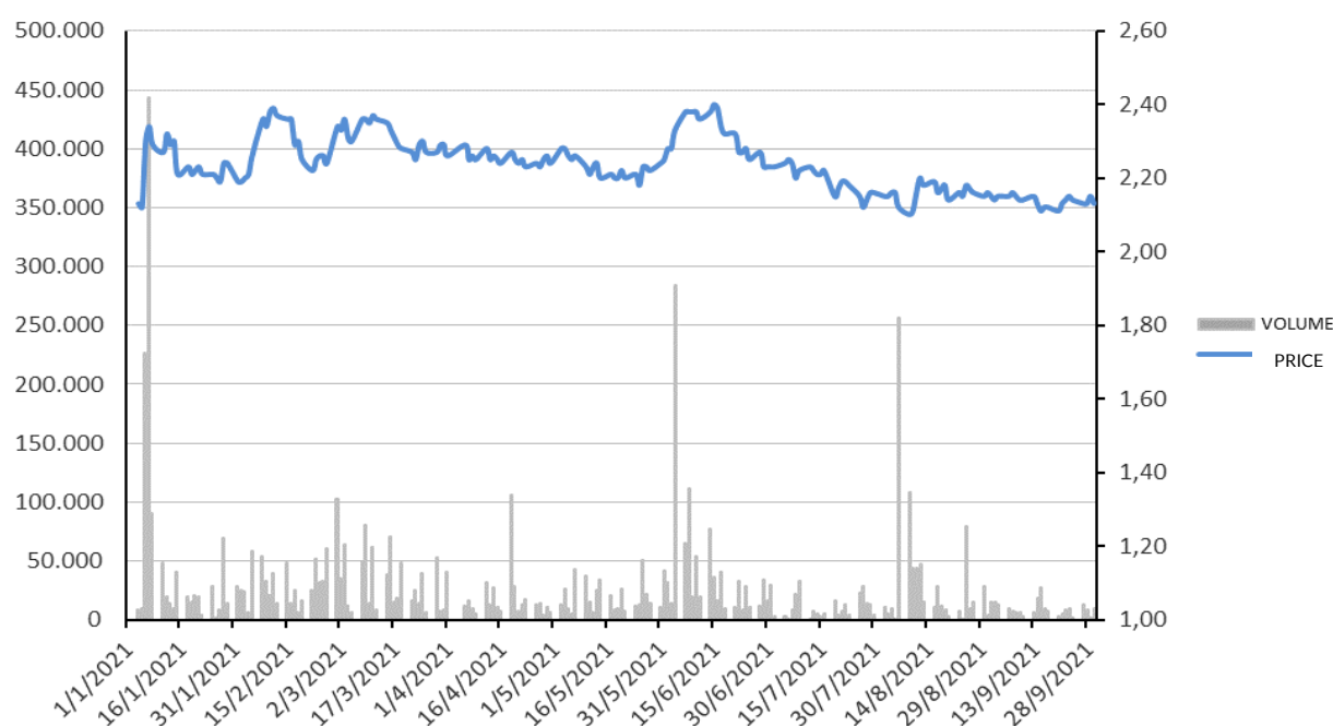
Share volumes and prices as at 30 September 2021

During 2021, the Investor Relations Team attended the Virtual STAR Conference Spring Edition (23 March 2021), the MidCap Conference (11 May 2021), the Virtual STAR Conference Fall Edition (12 October 2021) and it performed many individual and group calls with analysts and investors.