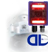
DL.Code Spring Rel. V1.0