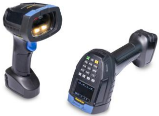
«Special» PS9600 RFID