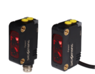
S3N contrast reader