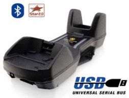
PS9600 USB Cradle