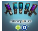
Memor™ 11 Family and Skorpio™ X5 with Android 13 Rel.