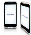
Memor™ 11 Healthcare